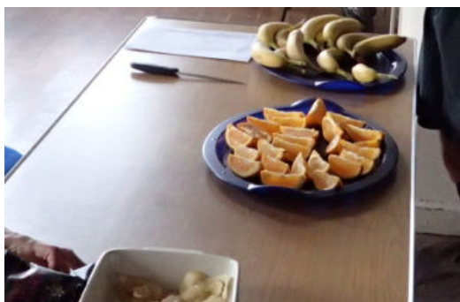
Peak Forest CP.