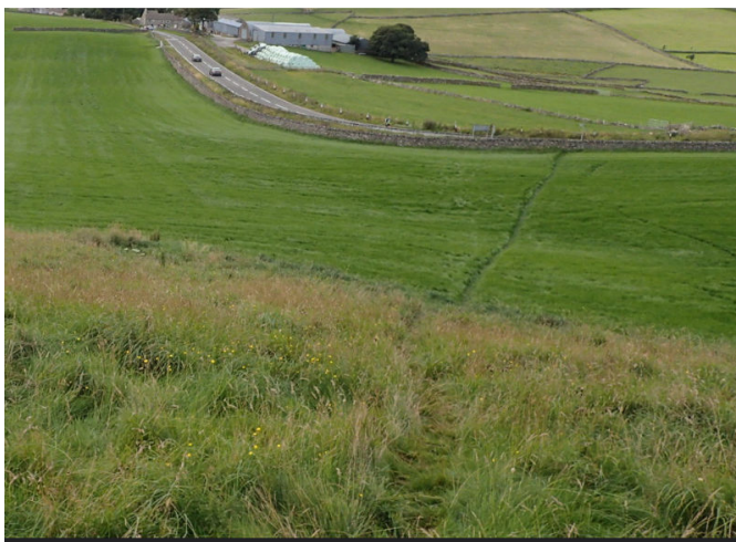
Thick grass after leaving the road from Peak Forest

After track and road it is a shock to be in long grass and the height/thickness and slight uphill means I allow myself to walk this section. Frisky cows plus a black bull in the next field spur me into action. As a cow chases me towards the stile over the wall I get faster and am over before the cow has slowed. A few more fields of long grass, just jogable then a straight quiet lane into Wheston. Closing in on me now were Jayne and her friend. They soon passed me on the track to Miller's Dale CP and I move back to 6 th . Oh well, at least I don't have to try and keep up with them. Jayne has an unusual toe first running style which obviously suits her – she is also incredibly cheery. A bit of an effort to get through the double gates into the farm yard to the CP in the barn. I thought there might be a bit of food on offer, but only water for me.